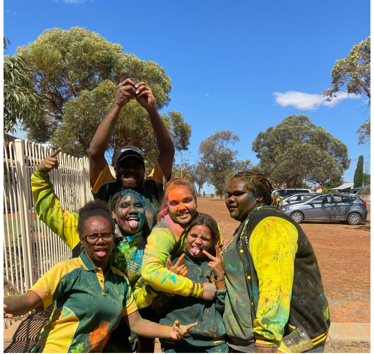
Part of Year 12 completion celebration in November 2020